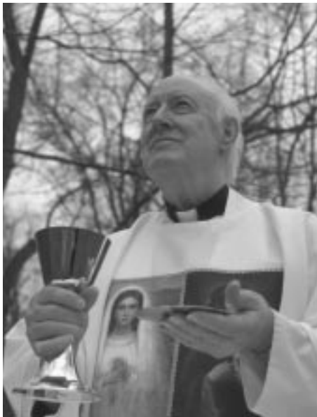
Through Him, With Him and In Him

dously as I am pressed on as I travel on my journey to the end of the day.